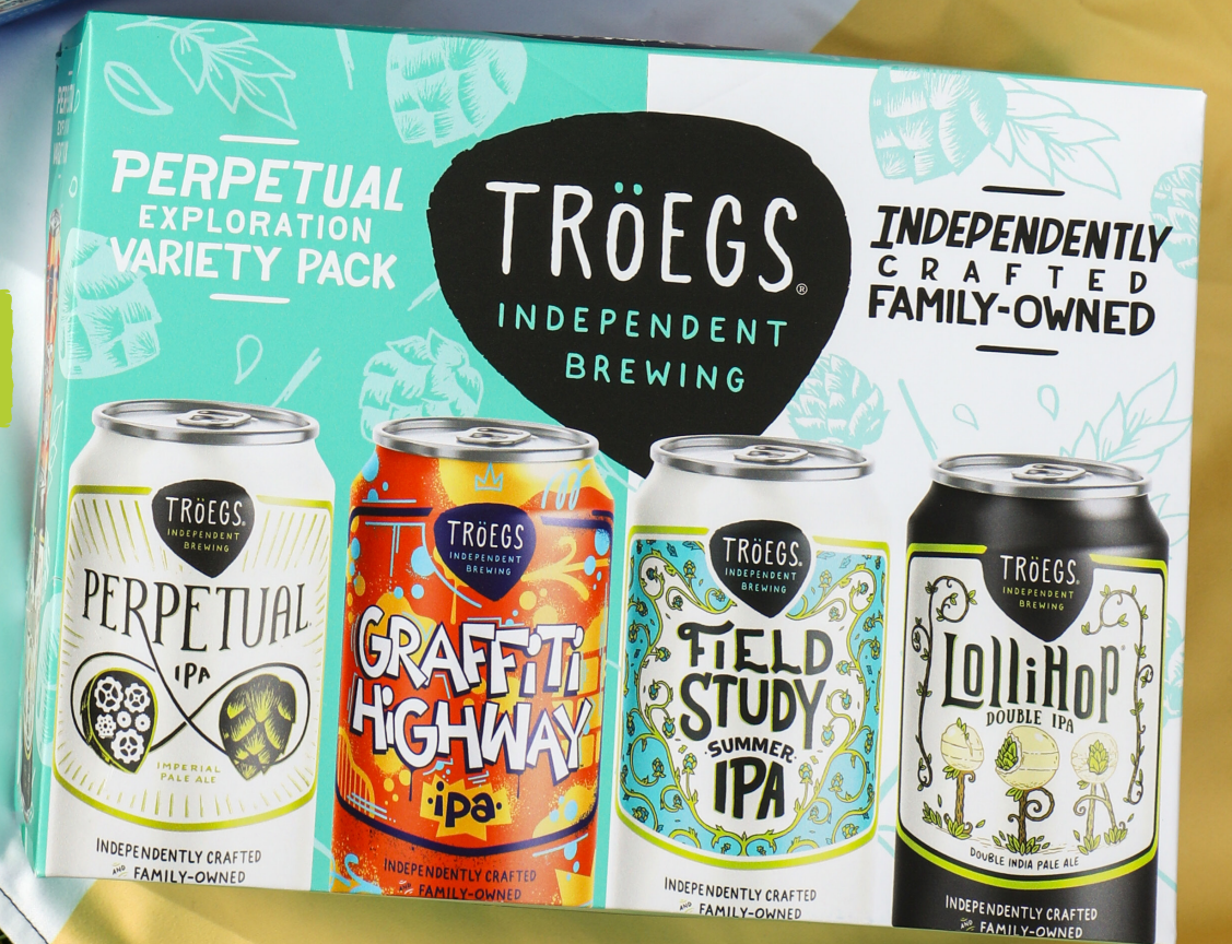
Perpetual Exploration: Summer releases in April in a 12-oz. can 12-pack