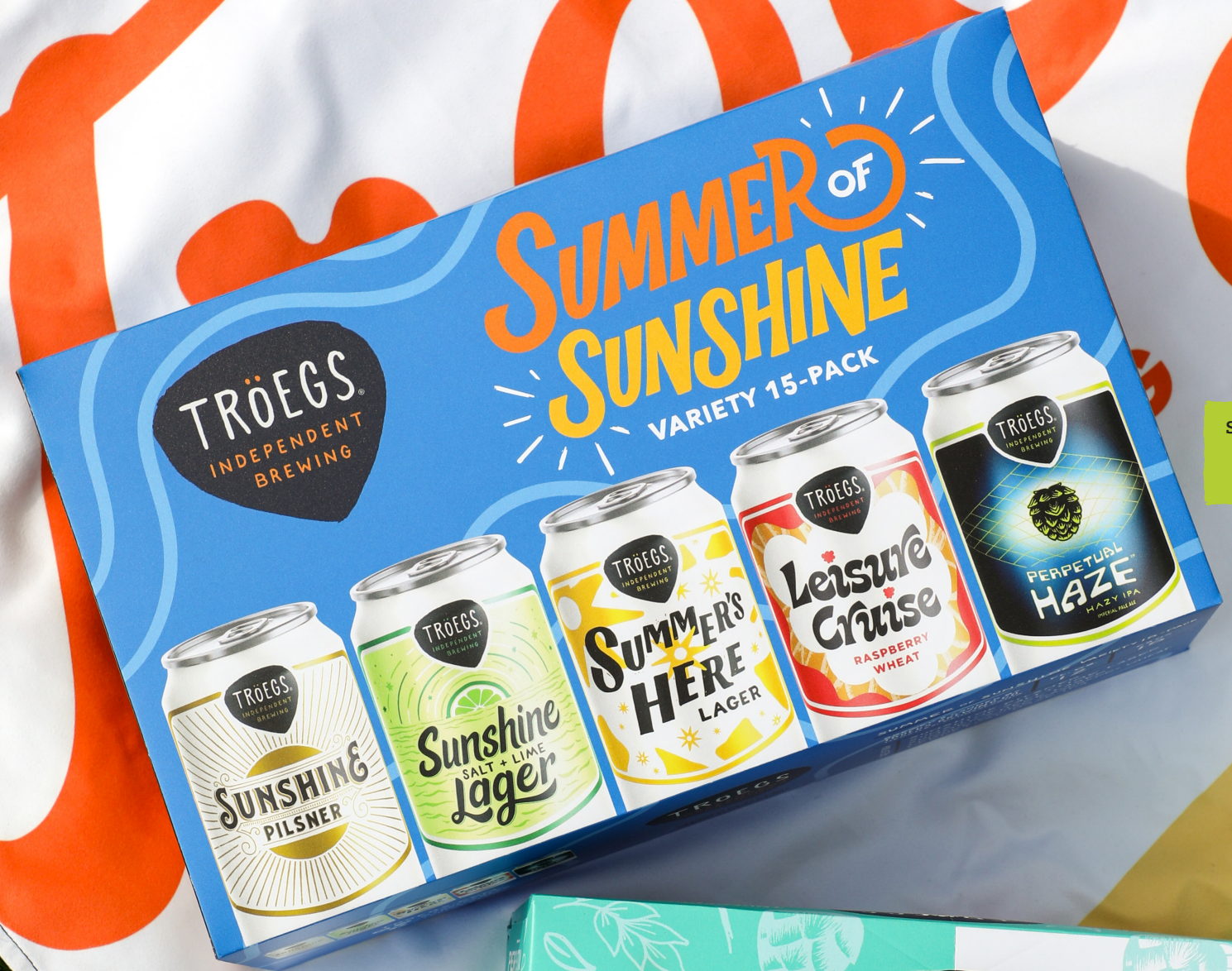
Summer of Sunshine releases in May in a 12-oz. can 15-pack

The Most Wonderful Beer of the Year holiday pack rounds out 2024. Perpetual IPA joins everyone's ruby-red favorite The Mad Elf and more for a collection of robust beers for celebrating the holiday season.