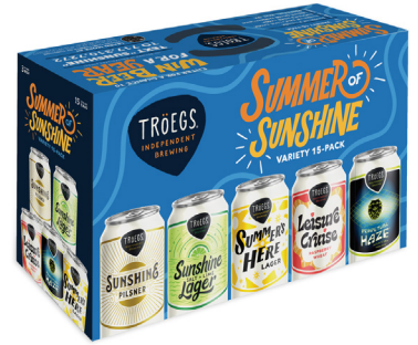
* Pack Exclusive

See what our Summer lineup can do for you. Order now! Contact your Tröegs sales rep: troegs.com/sales Contact your Tröegs wholesaler: troegs.com/wholesalers . Find posters, signs and price cards: troegs.com/retailer Follow us @troegsbeer on Instagram, Facebook and Twitter.