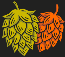
WARRIOR & TOMAHAWK HOPS SUBTLE BITTERNESS