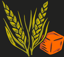
VIENNA & MUNICH MALT CARAMEL BACKBONE