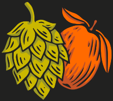
SIMCOE HOPS MANGO & CREAMSICLE